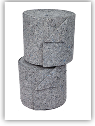
TR33-144 / TR27-144