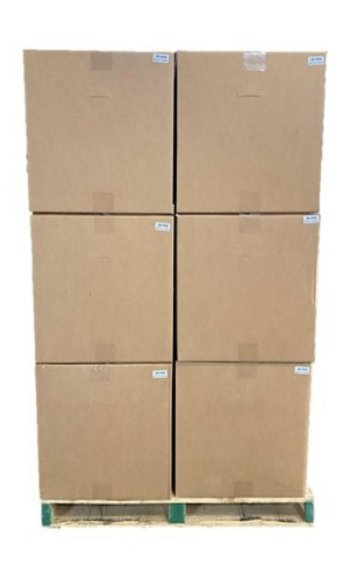
Ask about our pallet pricing!!